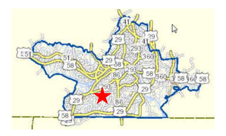
Area of spill (RED Star)