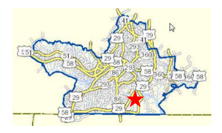
Area of spill (RED Star)