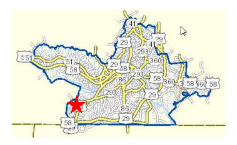
Area of spill (RED Star)